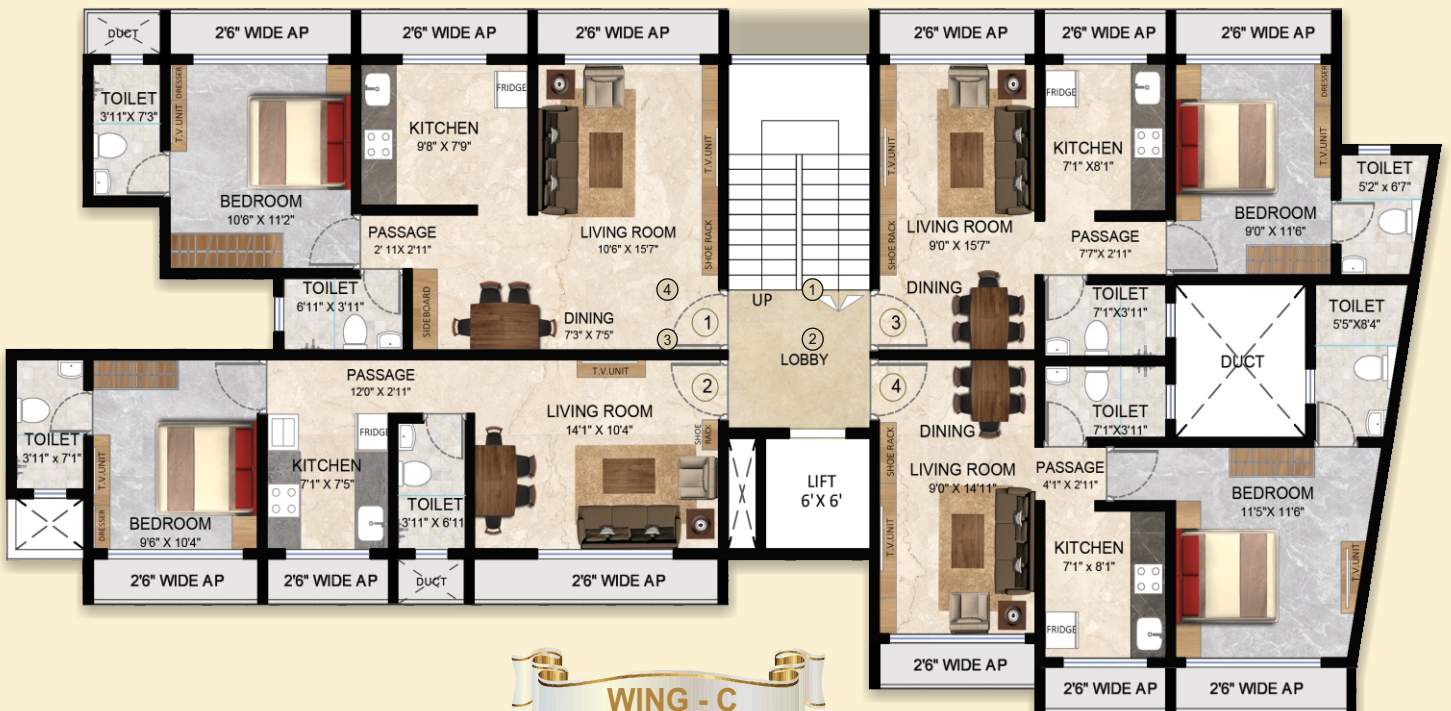
WING - C TYPICAL FLOOR PLAN