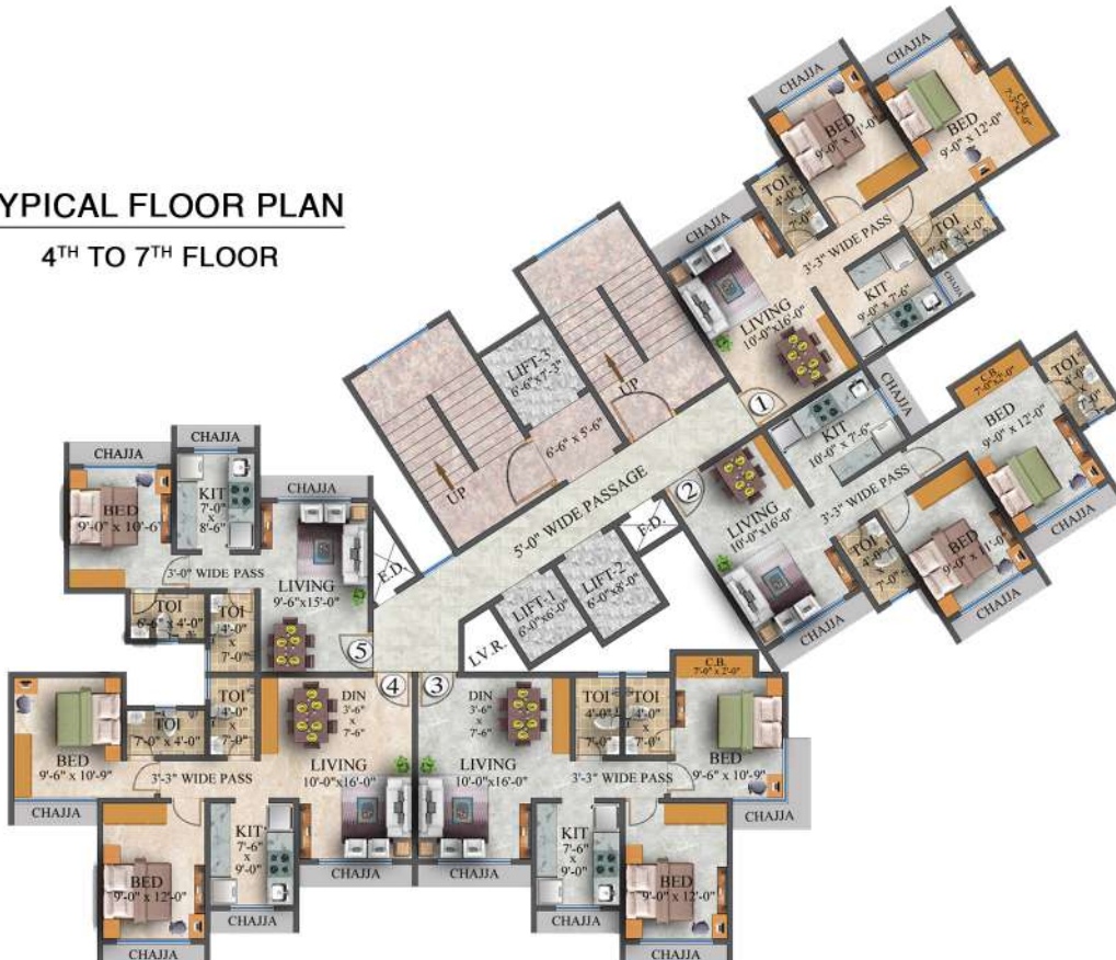
TYPICAL FLOOR PLAN 4 TH TO 7 TH FLOOR

Inhale the future of living Mira Road (East)